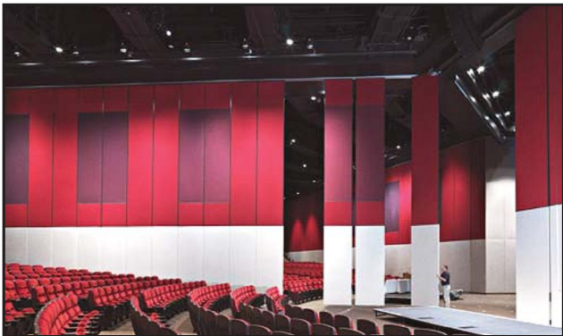
Although the panels range in height to 32', they can be easily moved into position when needed or stored in a nearby pocket when the entire facility is used. The panel finish matches the permanent walls.

Floor seals follow the slope of the floor and are easily extended or retracted with a removable handle.